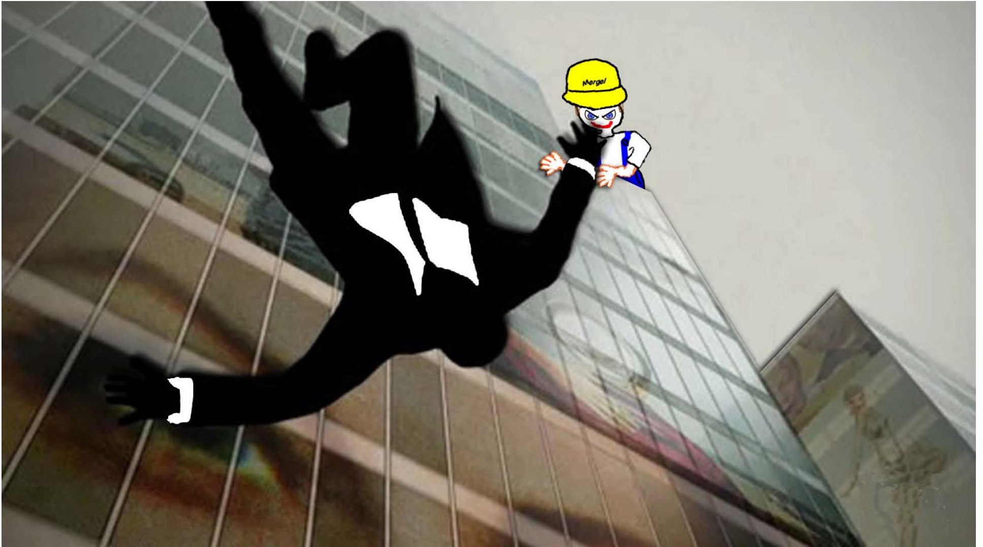
Mad Men – Where Push Comes to Shove...