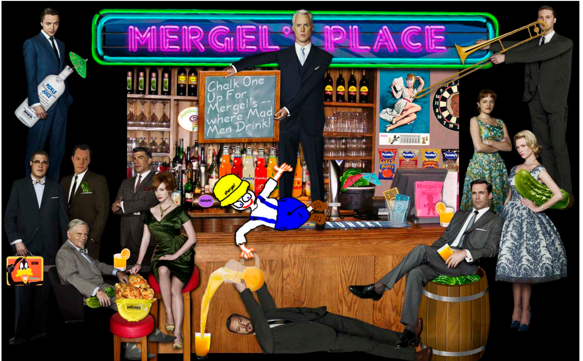
Mad Mergel's -- the best Place to get Juiced